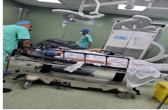
AAH staff preparing for operation (October 23, 2023)

Despite the challenges and damages, the hospital staff continues to provide urgent medical care for those physically injured and traumatized. Currently, the Surgical team deals mostly with injuries and trauma including abdominal, bone, chest, and soft tissue injuries. The Hospital continues to receive elective cases referred by other hospitals that are overwhelmed with thousands of injured patients. The Burn Care unit at Ahli is receiving hundreds of people, mainly children with severe burns resulting from the war. Ahli Hospital is receiving hundreds of people, particularly children, at the physical rehabilitation department and expects to receive thousands more within the coming weeks resulting from severe wounds and broken bones in children. Moreover, AAH receives new cases of (mostly children affected by inadequate hygiene, partly because of large amounts of refuse not collected, lack of potable drinking water, and food shortages. As a result of these things, children are suffering chest infections, diarrhea, rashes, and scabies. These admissions have averaged 150 cases per day. Ahli Hospital has also opened its doors to the family members of the wounded who are desperate because they have no other place to go. The Hospital has become their refuge of last resort. Care is being provided to these family members (food, lodging, psychosocial, etc.)