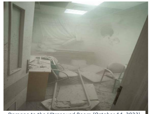
Damage to the Ultrasound Room (October 14, 2023)

The two air strikes that hit the hospital caused severe damage to the hospital's ambulance, medical equipment, and diagnostic machines (the Ultrasound, Mammography, ventilation system, an operating theatre table, and an anesthesia machine). In addition, there was damage to the infrastructure of some of the hospital departments including the diagnostic center, the ventilation system, the ultrasound room, the Mammography room, the administration and management offices, the hospital entrance and courtyard, the hospital parking, etc.). Moreover, four of the hospital staff who were wounded needed operational surgeries, and two of our staff had their houses demolished.