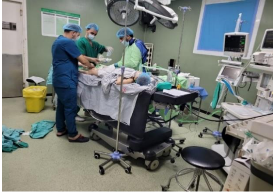
AAH staff performing a surgical operation (October 23, 2023)