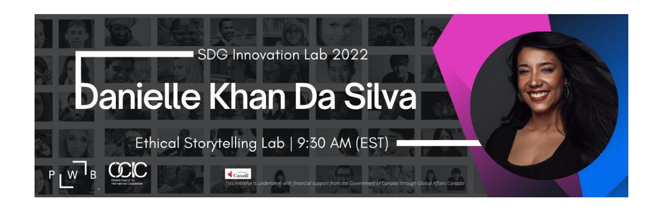
Day 2: Ethical Storytelling Lab & Creative Storytelling ColLaboration - February 12 | 9:30 am 4:00 pm EST