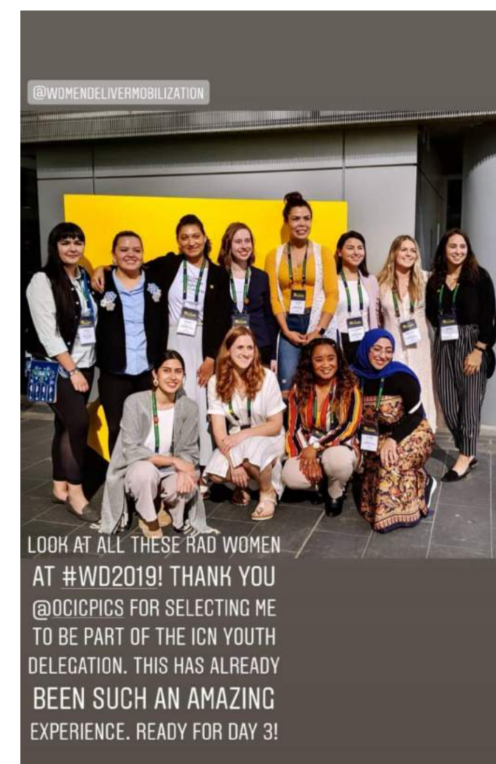
LOOK AT ALL THESE RAD WOMEN AT #WD2019! THANK YOU @OCICPICS FOR SELECTING ME TO BE PART OF THE ICN YOUTH DELEGATION. THIS HAS ALREADY BEEN SUCH AN AMAZING EXPERIENCE. READY FOR DAY 3!