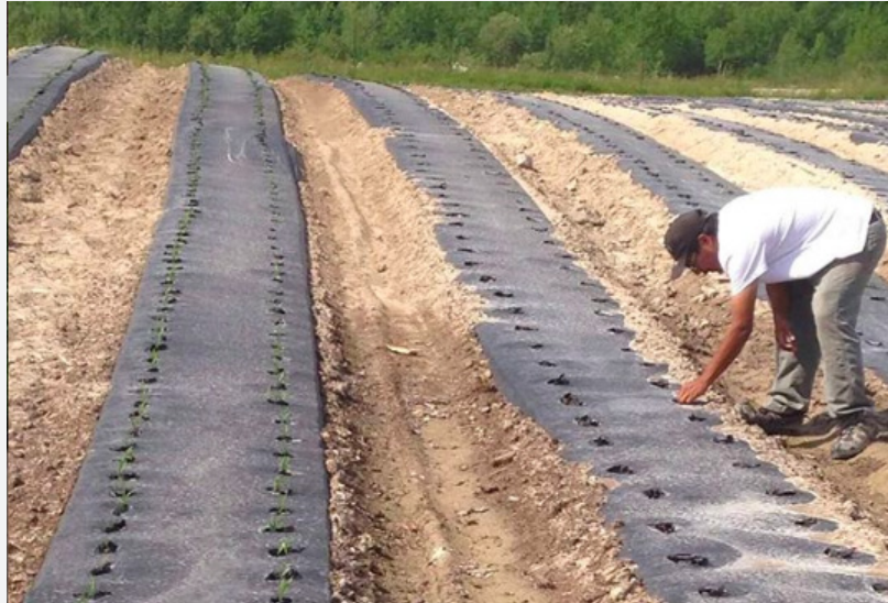
Fort Hope Farm strawberry planting.