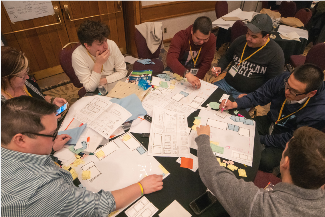
NAN Housing Strategy session on metric development and housing design.