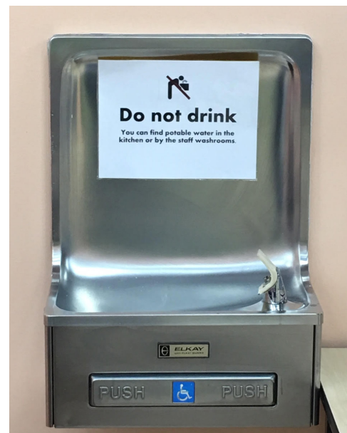
A drinking fountain found in a on-reserve JK-9 school is unusable due to a decades long boiled water advisory.

In this report, learnings from consultations with First Nations peoples in northern Ontario are used to provide direction to the development of a National Strategy focused on the improvement of well-being through self-determination.