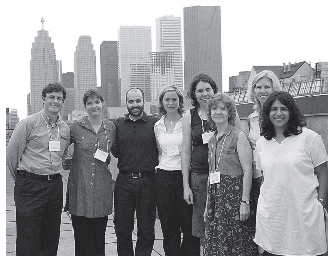
Some of OCIC's Board of Directors at the 2004 AGM.